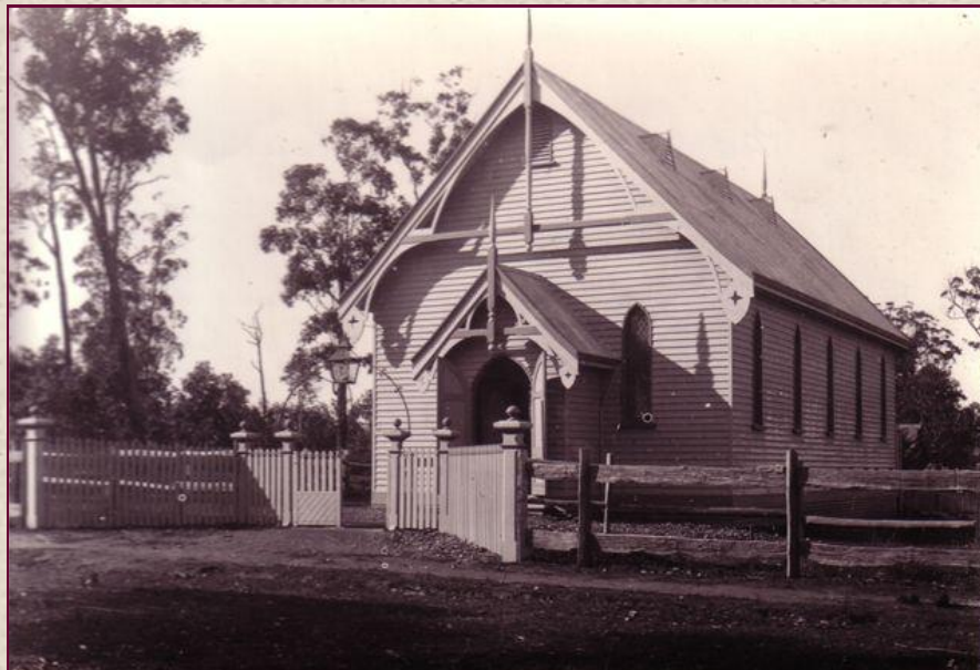
ORBOST PRESBYTERIAN CHURCH - opened in 1898.