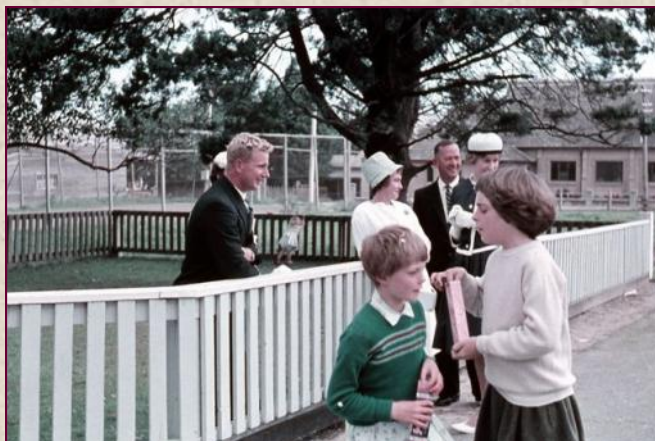
Above: GROUP IN FRONT OF CHURCH - with the Tennis Court and St James Anglican Church in the background.