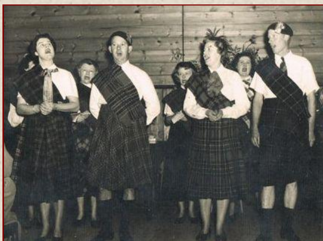
Above: CHURCH CONCERT - 1960s