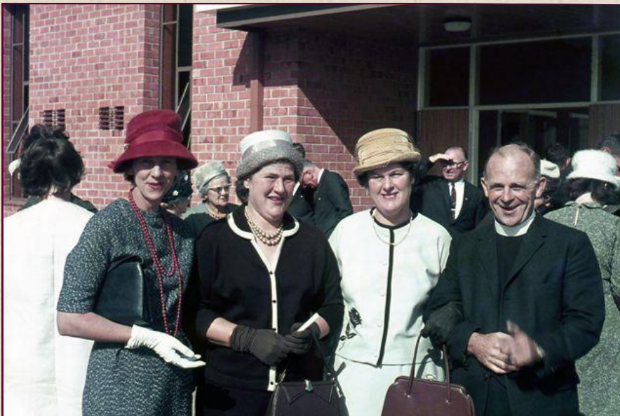
At the Opening and Dedication of St. Andrew's Church, Orbost, on Saturday, 2nd May, 1964.

The union of the Methodist and Presbyterian Churches was fraught with difficulties and misunderstandings. However, Sunday School was the first to amalgamate, with a decline in attendance during the early 1960s and a shortage of teachers in both churches, the move was essential. During the following years the Methodist Church lost several key members and the decision was taken to close the church. So on Sunday 29 th November 1970, a reciprocal co-operation service was held to celebrate the union.