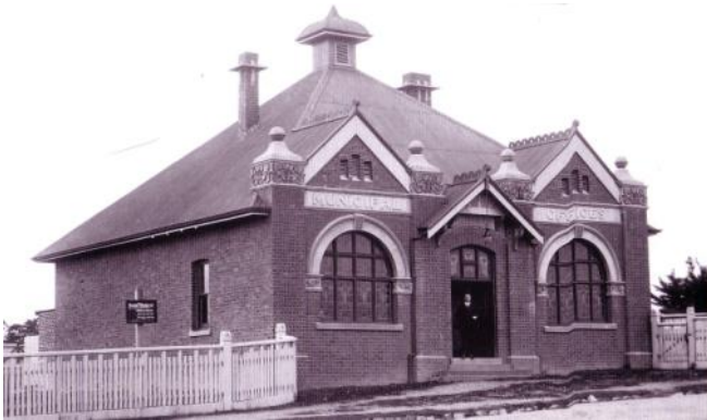
Orbost Shire Council Chambers

During the early years Orbost formed part of the Tambo Shire, but on May 30th, 1892, it was severed and created Croajingolong Shire, and on February 17th, 1893, the name was changed to Orbost Shire. For some years Lakes Entrance was part of the Orbost Shire, but was later attached to the Tambo Shire.