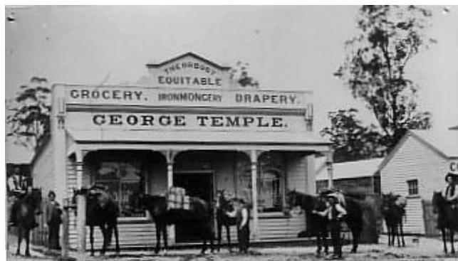
Temple's Store, Nicholson Street