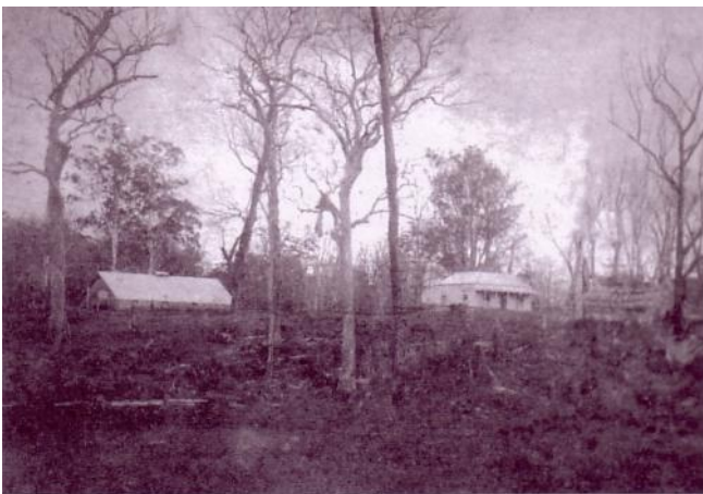
Lochiel Barn and House