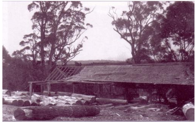
Richardson's Sawmill at Tabbara

boats were built at the shipyards at Tabbara.