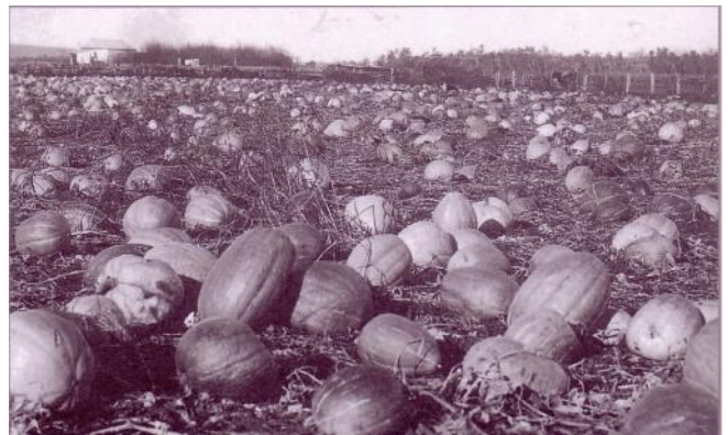
Paddock of Pumpkins on the Snowy River Flats

Pumpkins grew profusely on the rich river flats of Orbost, yields being 30 to 50 tons per acre, with an average weight per pumpkin of about 68 lbs., although John Johnston grew one 212 lbs.